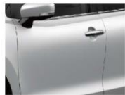
Pearl Arctic White