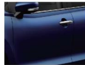
Premium Urban Blue