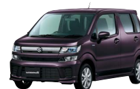
Moonlight Violet Pearl Metallic