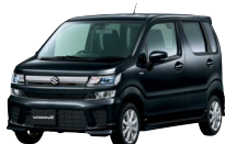
Blueish Black Pearl