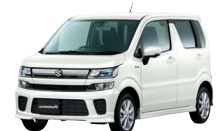
Pure White Pearl

Suzuki reserves the right to change without notice - price, colours, equipment specifications, variants and also to discontinue models. Accessories and features shown in the pictures may not be part of the standard equipment and will differ according to the variant. For variant specific features, refer to the equipment list. Colour shown may vary from actual body colour due to printing on paper.