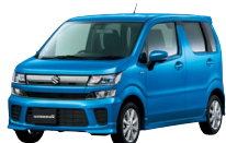
Brisk Blue Metallic