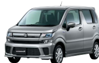
Steel Silver Metallic