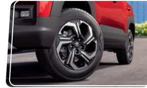
Bold Geometric Alloy Wheels

The Hot and Techy Brezza introduces a youthful and energetic design, ensuring you are ready for an adventurous drive in the city every day. Its commanding stance, impressive looks and precision detailing ensure that it never goes unnoticed. The City-Bred SUV comes with a clean Beltline with Bold Geometric Alloy Wheels, Dual Tone exteriors with a Shark Fin Antenna that enhances its design.