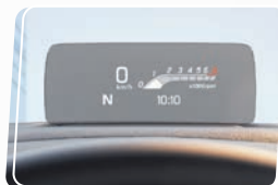
Head Up Display