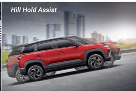
Hill Hold Assist