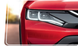
Dual LED Projector Headlamps with LED DRLs