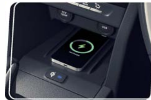
Wireless Charging Dock

The Hot and Techy Brezza carries a youthful and exciting appeal on the inside with your convenience at its core. It gets a unique design, modern and sleek look and black and brown interiors with silver accents for a sporty and urban feel. The City-Bred SUV also has Rear AC Vents, a Fast Charging USB Port (Type A and C) and a flat bottom Steering Wheel for your enhanced comfort and convenience. The 6-Speed Automatic Transmission with Paddle Shifters and Telescopic Steering ensure you go on city adventures comfortably.