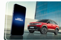
Next Gen Suzuki Connect