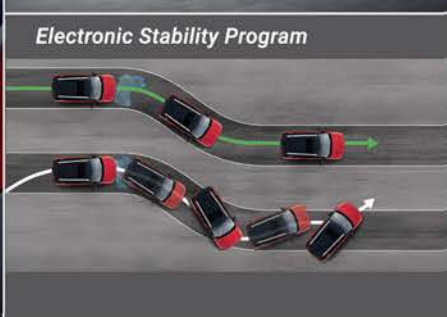
Electronic Stability Program