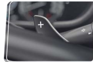
6-Speed AT with Paddle Shifters