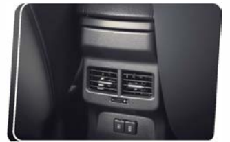
Rear AC Vents with Fast Charging USB Ports