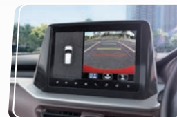
360 View Camera