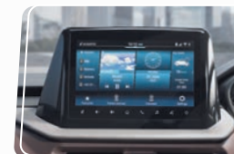
SmartPlay Pro+ with Surround Sense powered by ARKAMYS