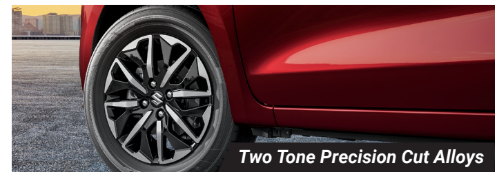
Two Tone Precision Cut Alloys