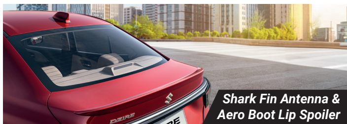
Shark Fin Antenna & Aero Boot Lip Spoiler