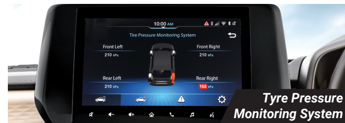
Tyre Pressure Monitoring System