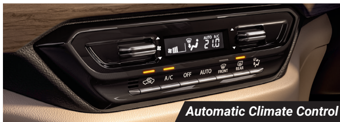
Automatic Climate Control