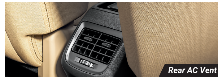
Rear AC Vent