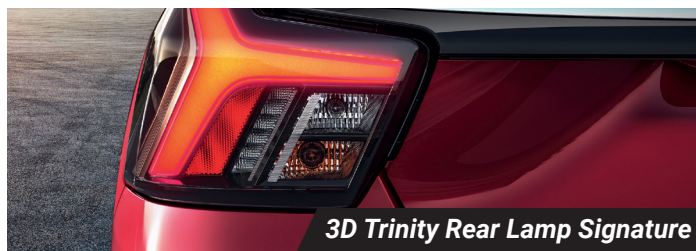
3D Trinity Rear Lamp Signature