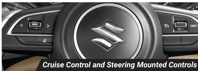
Cruise Control and Steering Mounted Controls