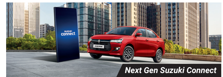
Next Gen Suzuki Connect