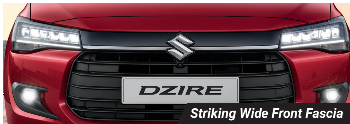
Striking Wide Front Fascia

It's only human to desire a lifestyle beyond the ordinary. Whether navigating city streets or embarking on weekend getaways, the Dazzling-New Dzire offers standout features, adding to its new, dynamic appeal. Its Progressive Sleek Design, with Striking Wide Front Fascia, Sleek Line LED DRLs, and LED Crystal Vision Lamps bring a seamless blend of function and fashion. It's perfect for those seeking luxury and practicality in their everyday journeys.