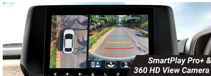
SmartPlay Pro+ & 360 HD View Camera