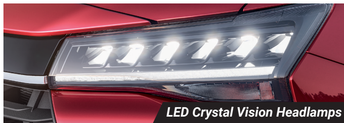
LED Crystal Vision Headlamps