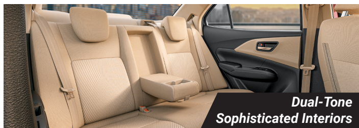
Dual-Tone Sophisticated Interiors