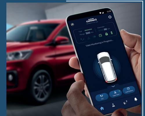
Connected Car Technology with Suzuki Connect Always stay connected with your car.