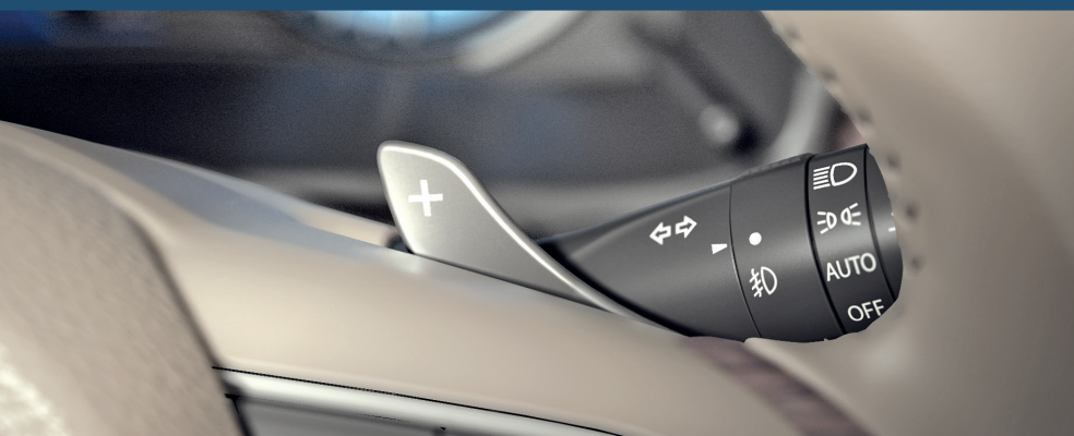
6-Speed AT with Paddle Shifters Surge ahead by engaging the smart paddle shifters.

● Togetherness, driven by technology. The Ertiga is equipped with state-of-the-art technology to add more fun to your moments of togetherness.