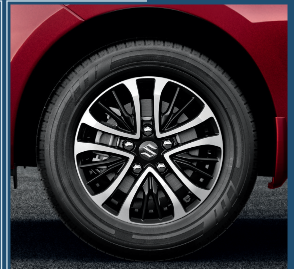
Machined Two-Tone Alloy Wheels Make a statement, every time.