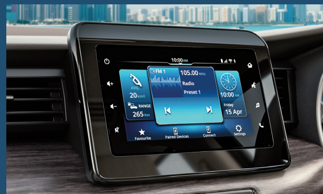
17.78cm Smartplay Pro Connect with your world with just a voice command - "Hi Suzuki".