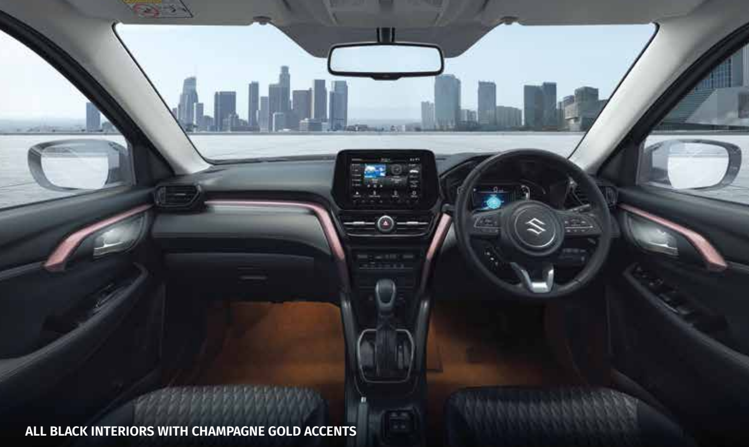
ALL BLACK INTERIORS WITH CHAMPAGNE GOLD ACCENTS